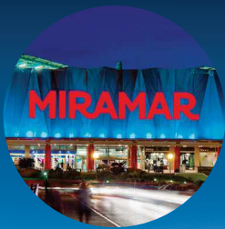
Shopping Centre Miramar