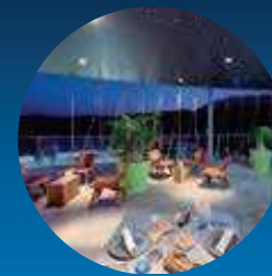
Hilton Resort & Spa